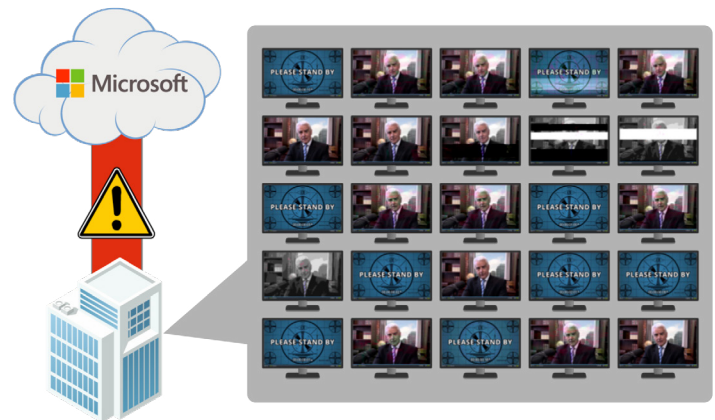
Video streams crossing your firewall can create network congestion, resulting in a poor quality of experience for viewers.

To create a high-quality experience for all viewers, AltitudeCDN resolves the network congestion created by bandwidth-intensive video by optimizing video traffic across your network.