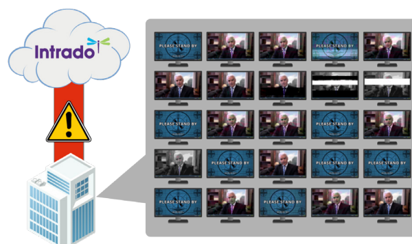
Video streaming across your firewall can create network congestion, resulting in a poor quality viewing experience.